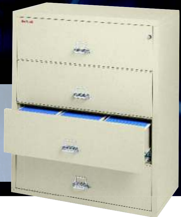
4-3857-CML: Four-Drawer Lateral International

Four times the filing capacity as the Two-Drawer Vertical International File. Now available in the popular low-profile lateral design.