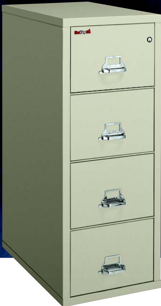
4-2157-VML: Four-Drawer Vertical International

FireKing model 4-2157-VML carries the ECB-S S60P label meeting all new European standards.